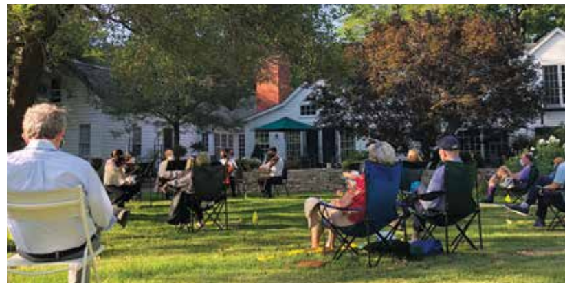
In August, guests gathered to hear another program by the Chamber Players at a beautiful private home in West Stockbridge.

After weeks of practice by the Chamber Players and intense planning by the Historical Society, both concerts were heart-warming successes, with every "seat" taken and the proceeds earmarked for the $80,000 matching grant from Massachusetts Cultural Council to replace the Old Town Hall's roof and repair its windows and doors. More than anything else, though, the events were confirmation that—with enough care and preparation—we can still join together as a community and continue to enjoy the things we love.