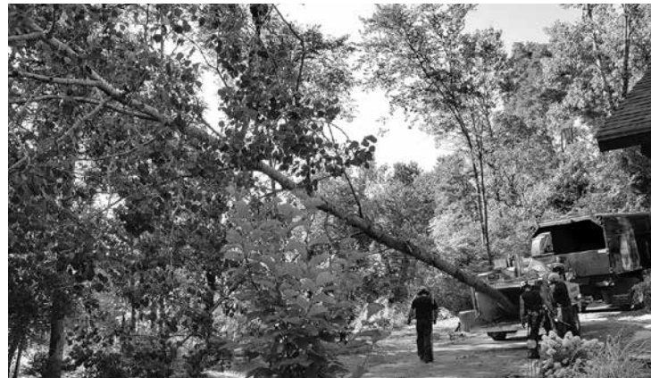
Tree being fed into chipper.

Questions, comments, rants, etc. can be addressed to info@localyokel.org .