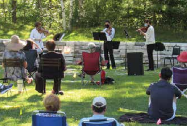
In July, the West Stockbridge Chamber Players performed in the amphitheater at TurnPark Art Space.