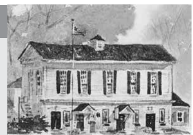
West Stockbridge Historical Society Incorporated in 1994

When friends, neighbors, or relatives move, downsize, or just clean house, please ask them to think of the West Stockbridge Historical Society before they discard any old books, pictures, postcards, letters, or memorabilia of the Town of West Stockbridge. E-mail info@weststockbridgehistory.org or call 232-4270.