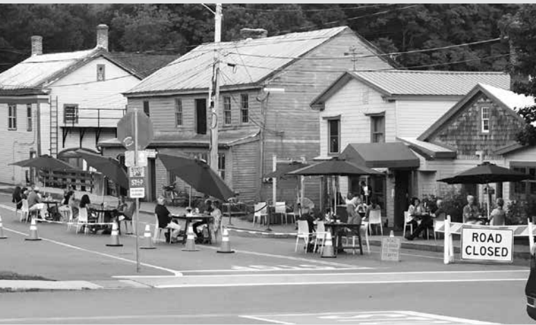
Rouge street dining.