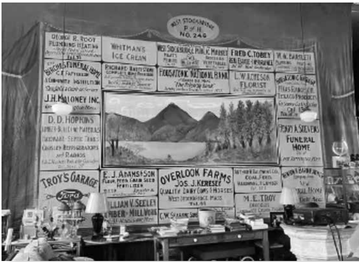
Signboard displaying mostly West Stockbridge businesses in old Grange Hall.