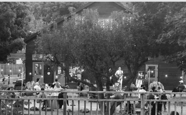
The Fremonts performing at The Foundry.