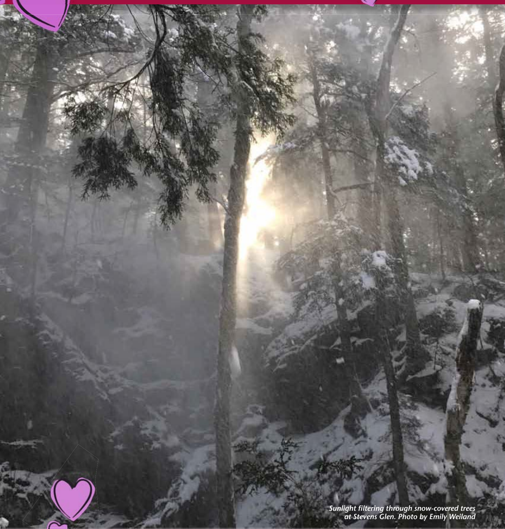
Sunlight filtering through snow-covered trees at Stevens Glen.

(n.) a country folk living in a quaint neighborhood community