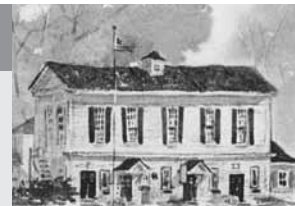
West Stockbridge Historical Society Incorporated in 1994