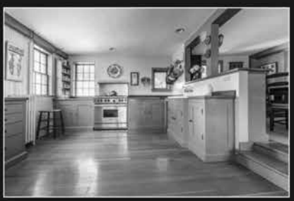
WEST STOCKBRIDGE • $449,000