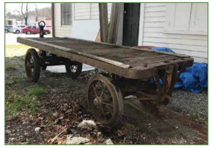
Restored railroad baggage cart.

This past spring, the Historical Society had planned a full slate of activities: jazz and Chamber Players concerts, history talks, a possible yoga class, and even a benefit reception. We were hopeful about our cultural grant application and eager to move forward with the building renovation after the winter. Things were looking good. Then the virus hit . . .