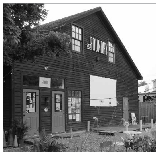
The Foundry's patio area will be used to present summer programs.