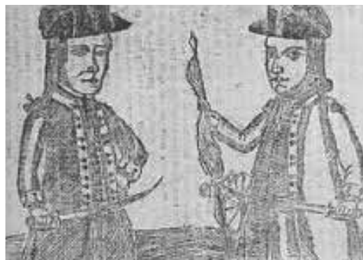
Engraving depicting Daniel Shays (left) and Job Shattuck, another rebel leader