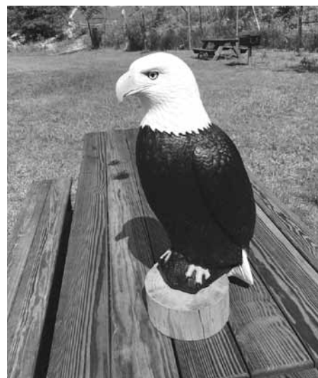
Eagle protects pond.

Watch out geese! Thanks to the kindness of a mystery donor, Card Pond is now under these watchful eyes of an eagle. Whoever you are, thank you—we need all the help we can get!