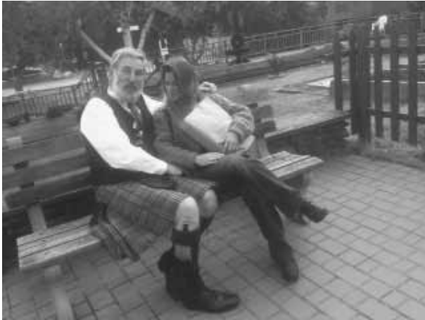
Village shoppers People of all stripes - and plaid - enjoy shopping in West Stockbridge!