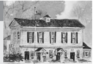
West Stockbridge Historical Society Incorporated in 1994

Not long after the end of the American Revolution, the country experienced a major civil disruption, Shays' Rebellion (1786–87). Although multiple factors were at play, the root cause of the rebellion was a new country with limited economic systems in place. All imported goods from England required hard currency. Farmers were required to pay for goods and service their debt with hard currency. No banking or credit was in place, and hard coin was limited. Complicating it, soldiers' pay and bonuses were made in unaccepted paper currency. Debtors' courts were biased toward the Boston merchants, and many farmers faced debtors' prison and their farms were seized. Urban/merchant society versus the agrarian/farming counties played as much a part as the economic issues in this first culture war.