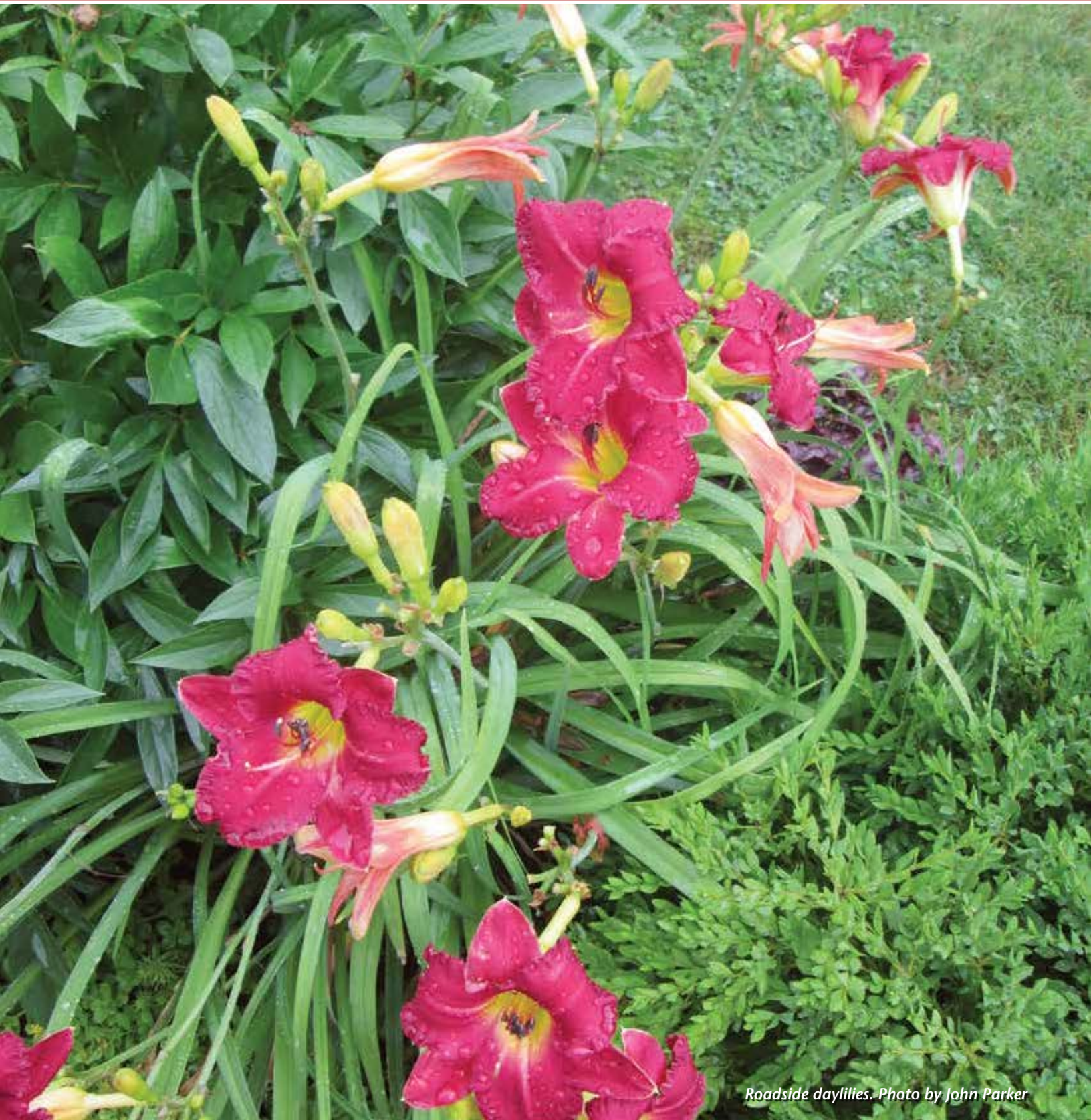
Roadside daylilies.

(n.) a country folk living in a quaint neighborhood community