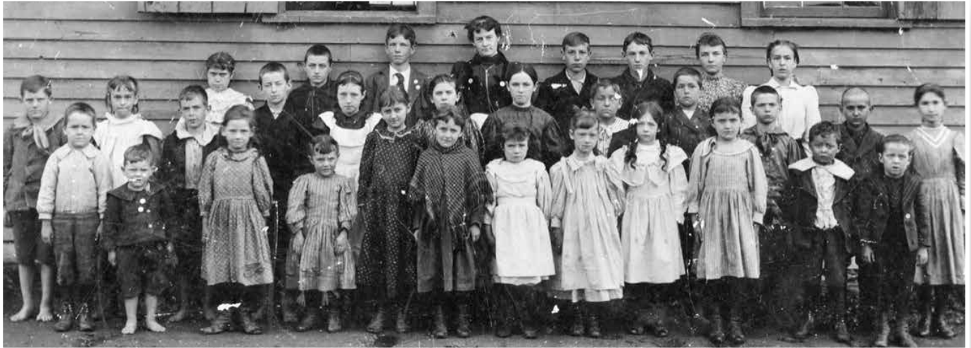
State Line School.

The seven school districts corresponded to the town's neighborhoods or hamlets where people were concentrated around the industries: State Line, West Center/Maple Hill, West Center-Four Corners, Williamsville, Freedleyville, Village Center, and Leete Ore Bed (the intersection of West Center Road/Route 102). Each district collected its own school tax and used that to build the schoolhouse and pay the teachers. The schools were heated by wood (or coal, if they were lucky). Privies were outside, and there was no insulation in the walls or roof. There was never enough money to maintain the buildings properly and pay the teachers. Surprisingly, many of these buildings were in use until the 1920s.