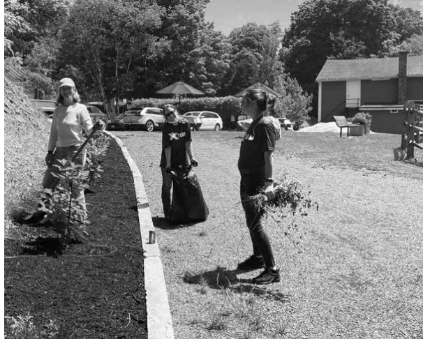
Spreading mulch and weeding the upper parking lot