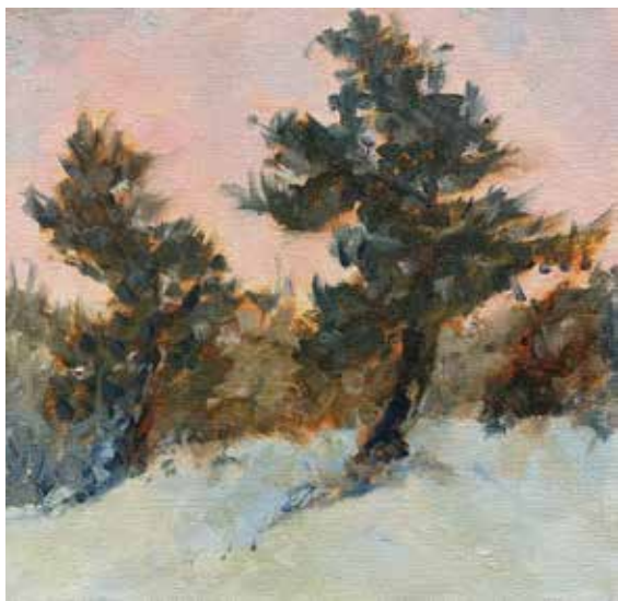
Pines in the wind