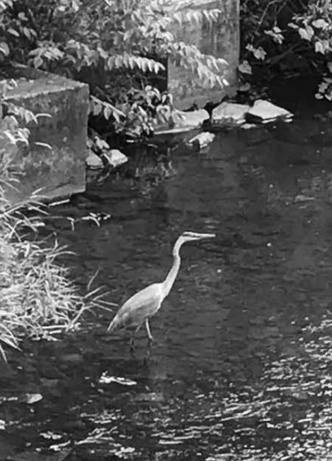
Great Blue Heron on Williams River.