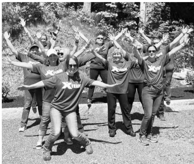
Our enthusiastic Berkshire Bank XTEAM volunteers